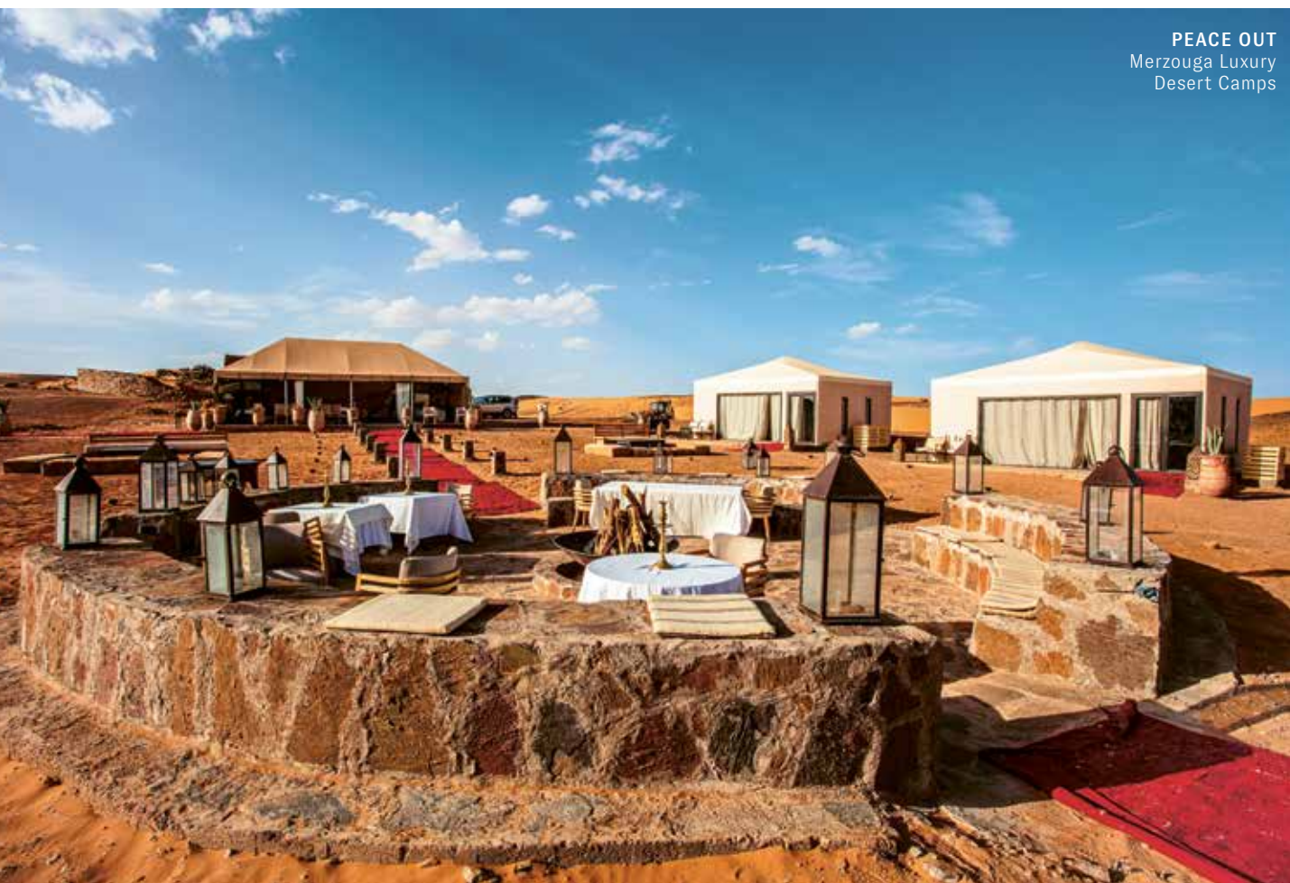
PEACE OUT Merzouga Luxury Desert Camps