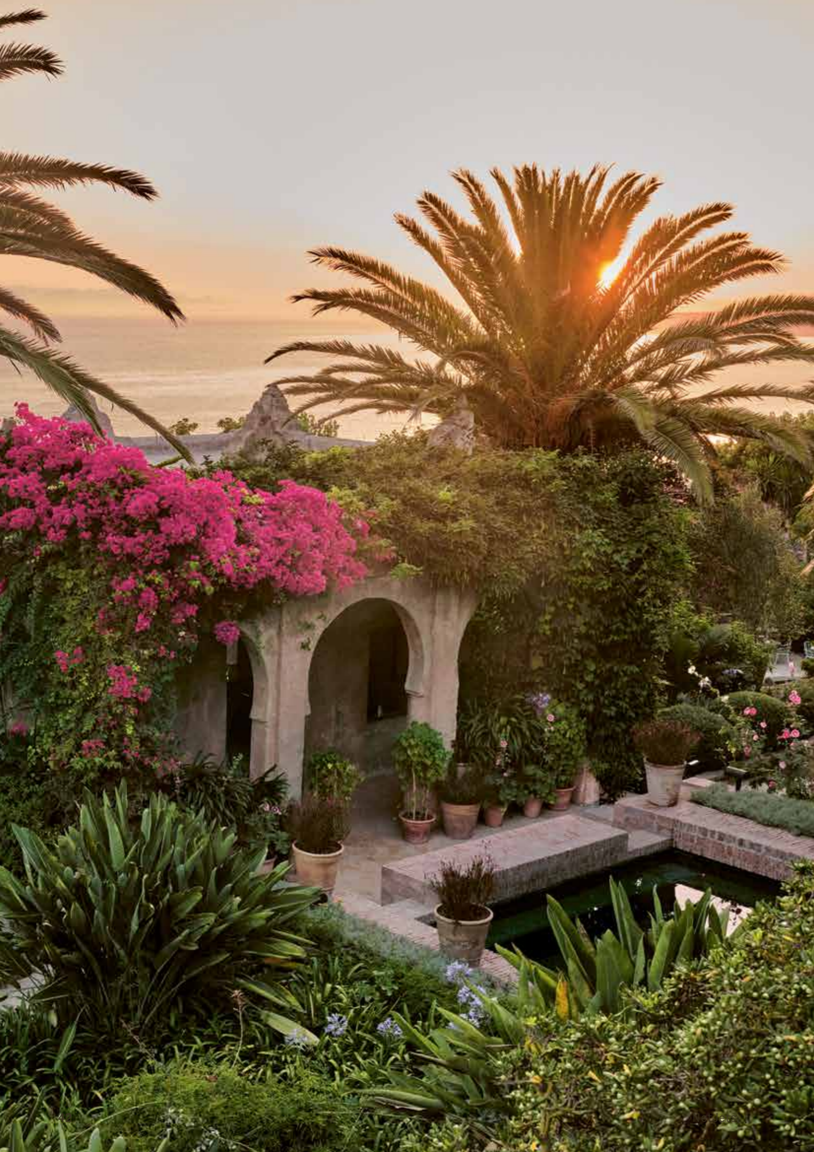
GREEN PARADISE The gardens of Villa Mabrouka.

South of Casablanca, on a quiet stretch of coast between the cities of Safi and El Jadida is La Sultana Oualidia ( lasultanahotels.com ), the sister property of Marrakech's opulent La Sultana hotel. Perched at the edge of a sheltered lagoon, this 12-key boutique beauty is surrounded by market gardens and prickly pear-studded salt marshes. Rooms—including a quirky “treehouse” suite hidden among palms—feature earthy natural materials such as stone, repurposed marble, and oleander wood. Daytimes revolve around surf lessons, horseback riding on the beach, and argan oil massages, while evenings are dedicated to slurping locally caught oysters on the overwater deck, and lounging in the private seawater Jacuzzis that come with each room.